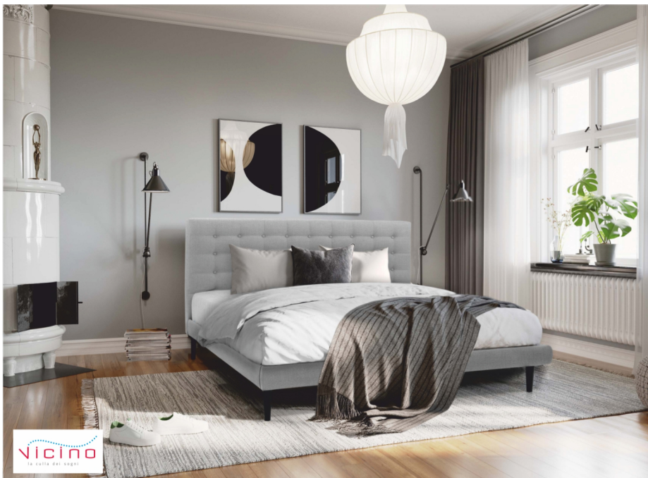
ON THE PHOTO: upholstered bed (ROUND) headboard from the LOS DOT collection, 20 cm high wood legs, headboards size (Height x width) 110 m. x 180 cm, bed size (width x length of mattress) 160 cm x 200 cm