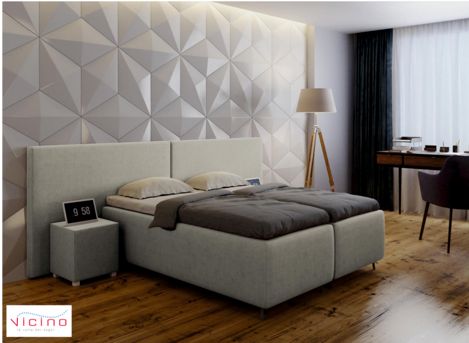
IN THE PHOTO: two separate single beds which can be put together, a headboard from the DARU collection, 10 cm high metal legs, headboard size (height x width) 112 cm x 2 x 170 cm, bed size (width x length of mattress) 2x100 cm x 200 cm